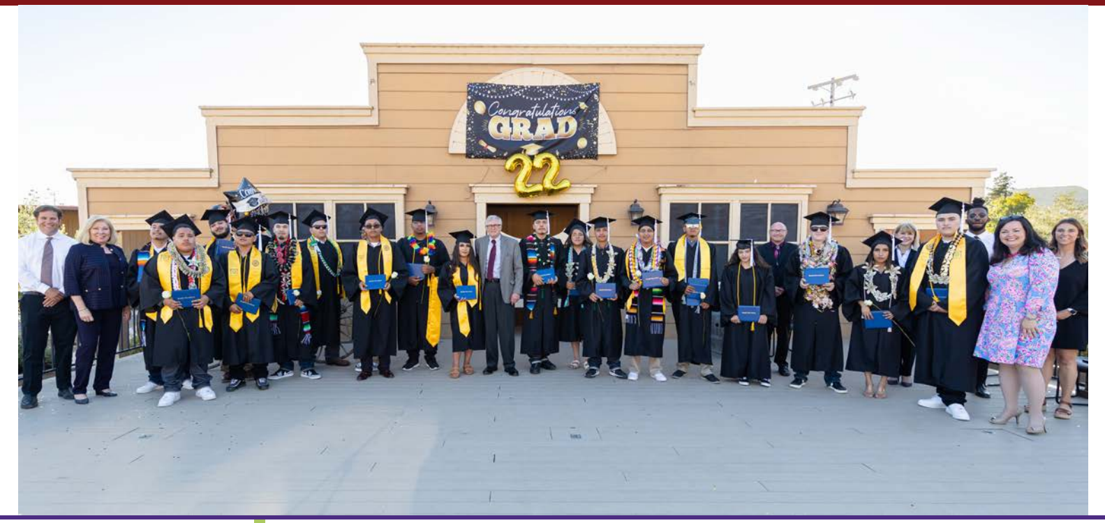
Pictured: RC graduates and dignataries