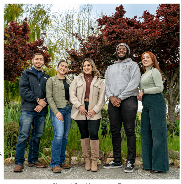
Pictured: Case Management Team

If needed, they provide students a ride home, to appointments or court proceedings, which they will attend for moral support. They also meet with Probation Officers about their progress or write character reference letters. If students are interested in college, they help demystify the application process, as many will be the first in their families to attend. Additionally, Case Managers connect students with apprenticeships, internships and full-time jobs and assist with resumes, job applications and interview preparation.