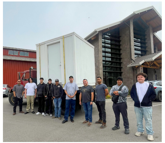
Ag Tech Team with their refrigeration build

Our Ag Technology/Mechatronics program recently completed a super cool project – literally. It all started when our partners at Kitchen Table Advisors connected our Ag Tech team with a need that was right in our own backyard: commercial refrigeration for farmers. When farmers harvest their crops, they need to be able to keep